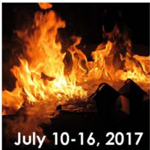
July 10-16, 2017