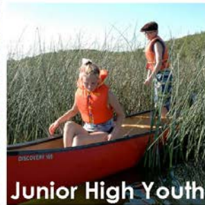
Junior High Youth