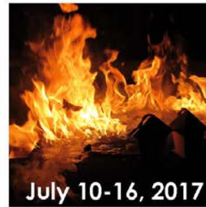
July 10-16, 2017