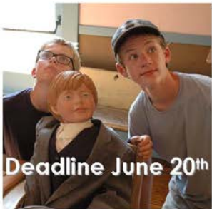
Deadline June 20 th