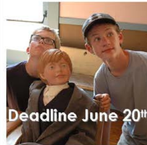
Deadline June 20 th