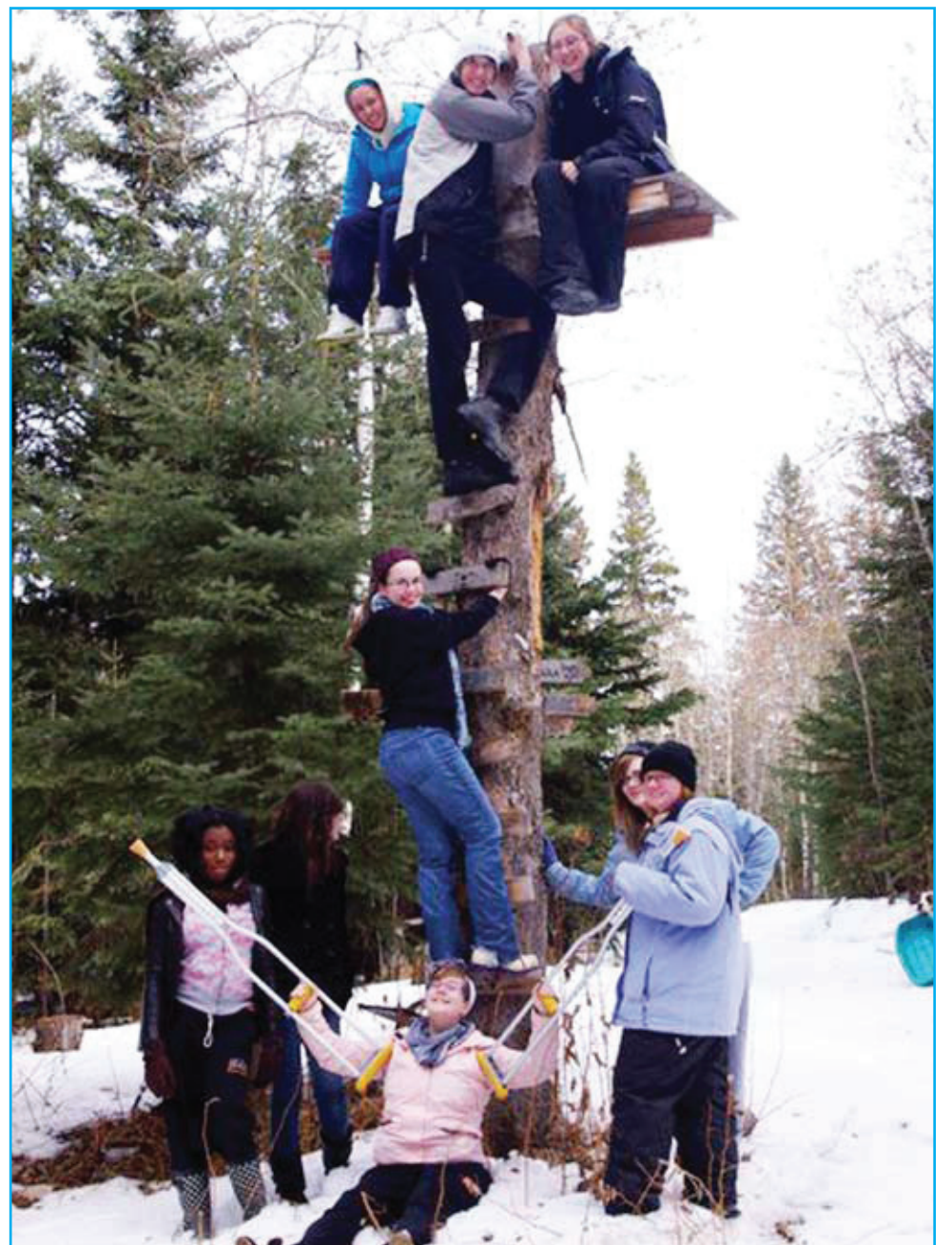
Winter campers went hiking and discovered this totem pole - a scouts look-out point.