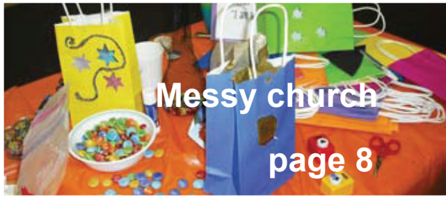
Messy church page 8