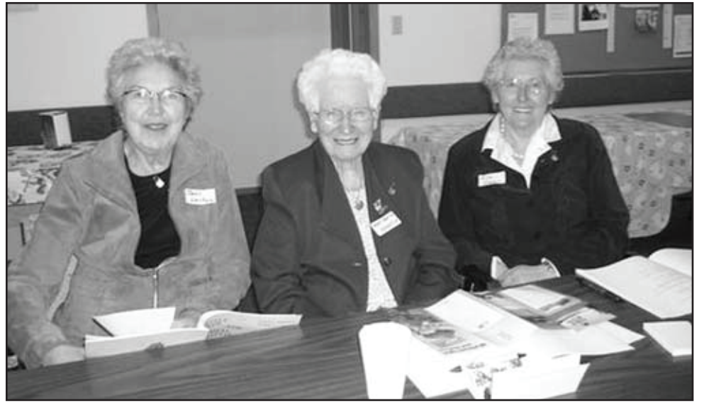
The Edgerton ACW ladies.

The next Battle River Regional meeting will be held in Edgerton on April 2, 2011. The day finished as members lingered to chat with friends before starting homeward.