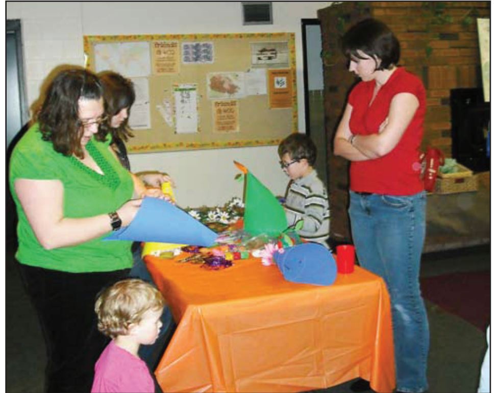
Making silly epiphany party hats is serious business!

Our gatherings have typically been small in number. The presence of God can only spill out and sweep others up in its beauty and joy, though, so we're trying hard to get the word out through personal invitations, flyer drops, and advertising in Spruce Grove and Stony Plain. If you are in the area and want a fun, goofy way to introduce people to Jesus, please come and make some sock puppets with us, and stay for a burger or two!