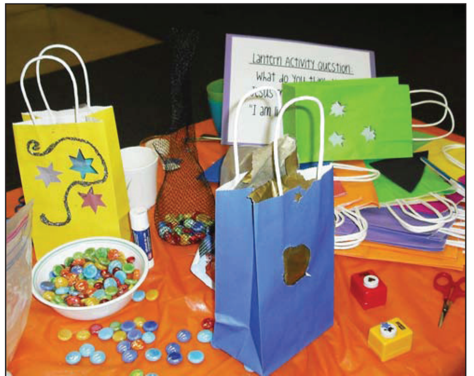
"Jesus, light of the world" lantern table after the creative hoards have moved through.