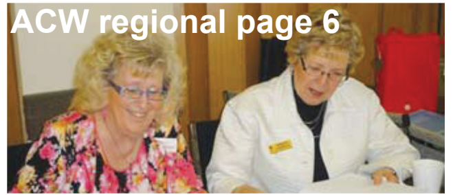
ACW regional page 6